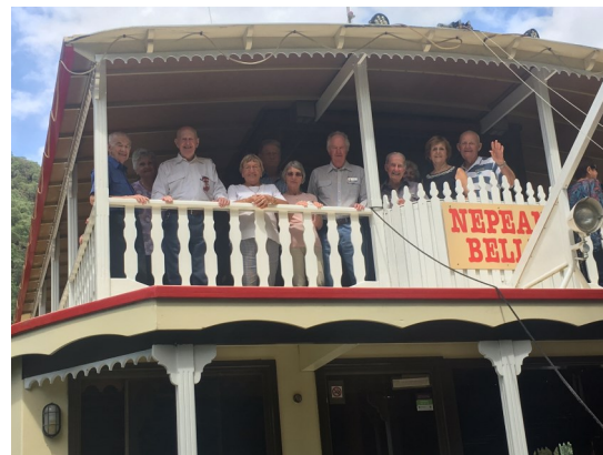
The Nepean Belle day trip was a great day. Fabulous time had by all!