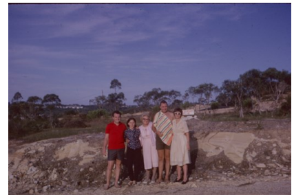
Rupari Place, Belrose