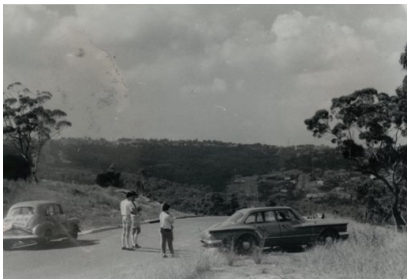
Looking East from Roselands Avenue Frenchs Forest 1970